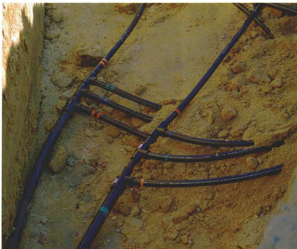
Color-coding keeps loops straight. Manifolds divide the single supply and return lines into four separate circuits. Colored vinyl tape identifies each circuit, two stripes for supply and a single stripe for return.