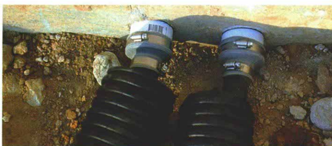
Sealing foundation against leaks. Where supply and return lines penetrate the foundation, the author uses plastic sleeves and boots to seal out water. Corrugated plastic drain line protects the water loop from damage.