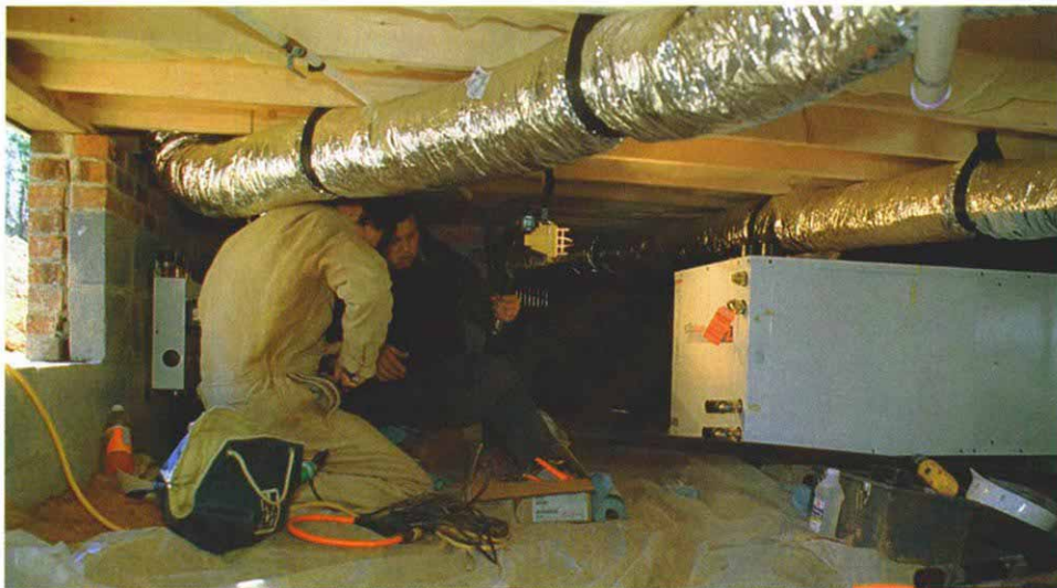
Heat pumps can live virtually anywhere. Even a crawlspace with crouch-only headroom is large enough for this style of heat pump. Other models stand upright. Supply and return ducts are insulated.

Before any excavation begins, we measure and mark off the area for trenching, and we always contact local utilities for information on buried gas, water and electric lines. In this installation, we were lucky. There was plenty of room behind the house for the trenches. I decided to go with two separate trenches that are parallel for about half their length. As I neared the tree line, I turned the trenches back toward the house, so from the air,